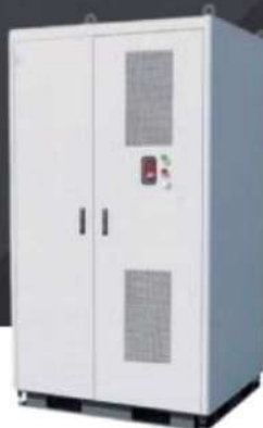
BCH-100230 Liquid-Cooling Energy Storage Cabinet