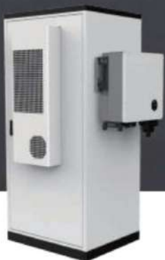
AU-CES-100kWh Hybrid All-in-one Battery Cabinet