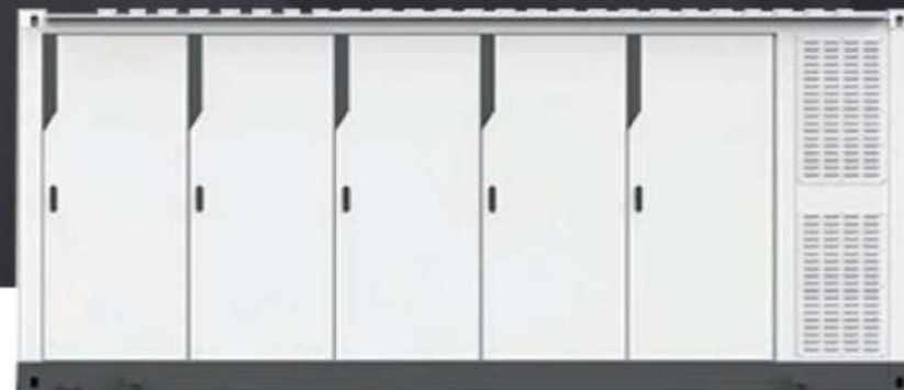
AU-CES-600K/ 1376kWh Containerized Liquid Cooling ESS